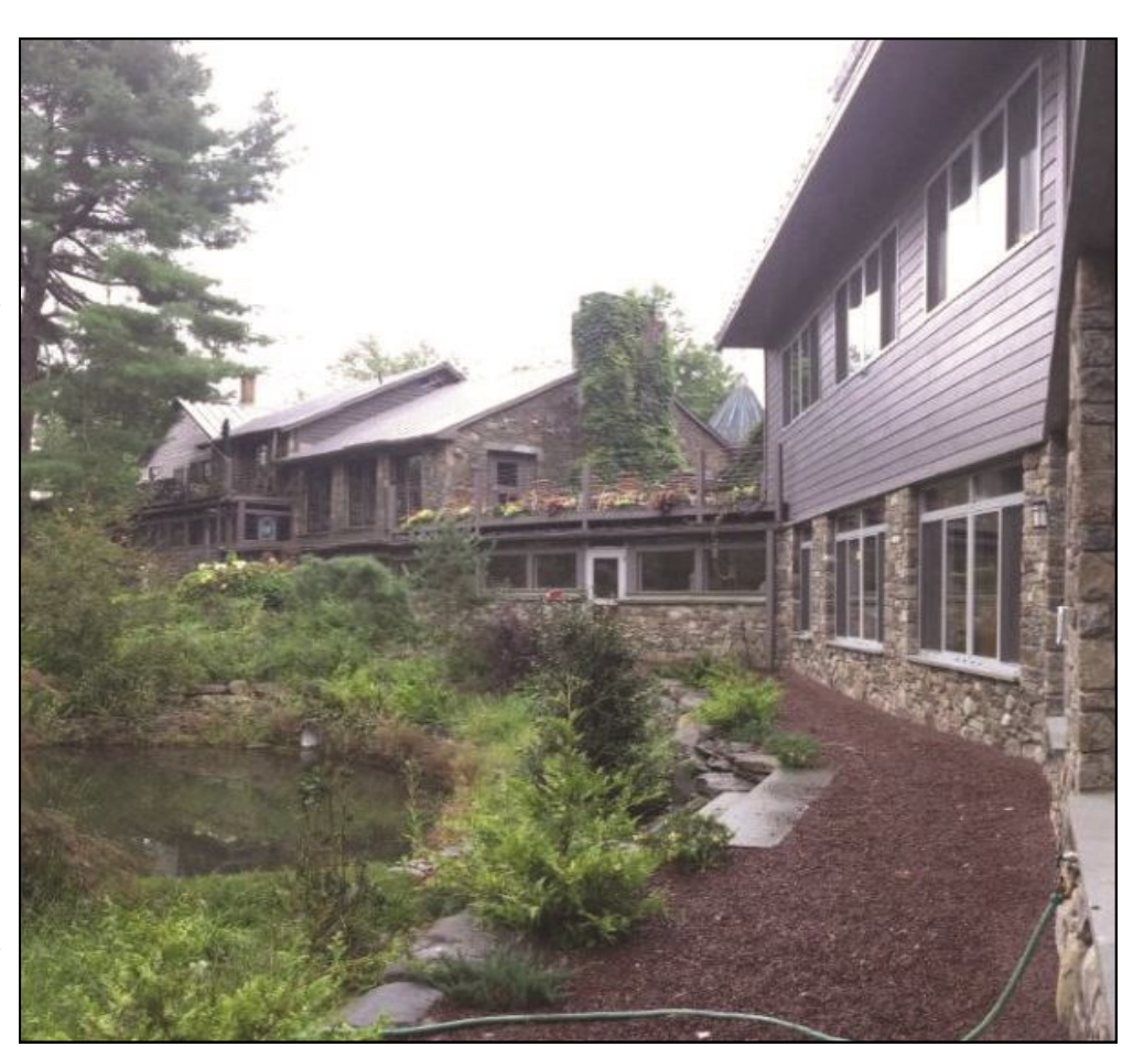
Founder's Hollow upkeep allows the scenic grounds and facilities to provide a spiritual respite for retreat-goers.