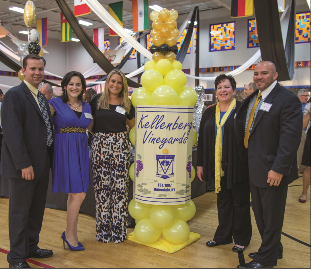
performance and delicious aromas The Food and Wine Expo coordinators stand beside the wine bottle-shaped balloon sculpture

Aces Wine and Spirits and the Parducci stomping ground while gushing over the Hempstead has provided Long Islanders food from Jake's Steakhouse. Attendees began to scan the raffle prizes and notice